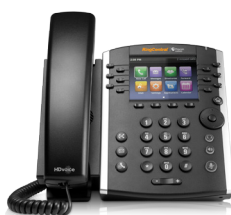
Advanced Color IP Phone