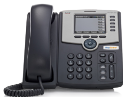
Advanced Executive Color IP Phone