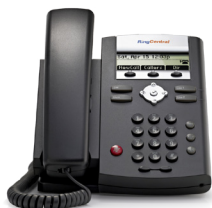
Basic IP Phone