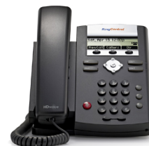
HD IP Phone