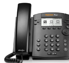
Business IP Phone