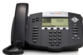
HD Manager IP Phone