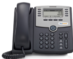
8 line IP Phone