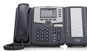
Cisco SPA 525G2 with expansion modules