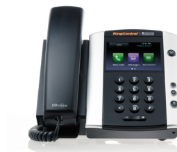
Advanced Executive Color IP Phone